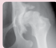
X-ray of an arthritic hip joint in a dog. The symptoms of arthritis are often much worse in overweight pets.